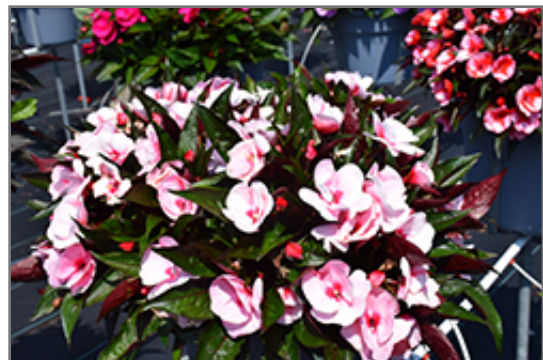
Petticoat Cherry Blossom New Guinea Impatiens in bloom