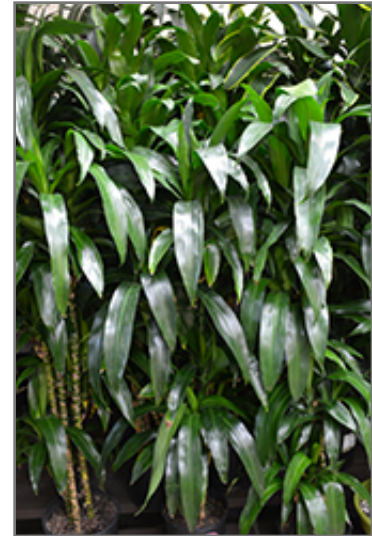
Lisa Dracaena foliage

This is an herbaceous evergreen houseplant with an upright spreading habit of growth. Its relatively coarse texture stands it apart from other indoor plants with finer foliage. This plant may benefit from an occasional pruning to look its best.