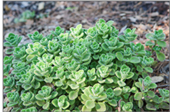
Mexican Mint

Mexican Mint features showy spikes of lavender flowers rising above the foliage from mid spring to late fall. Its attractive fragrant pointy leaves remain chartreuse in color throughout the year.