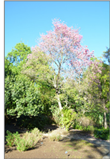
Pink Trumpet Tree in bloom

Pink Trumpet Tree is recommended for the following landscape applications;