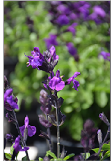
Mirage Violet Autumn Sage flowers

This is a relatively low maintenance plant, and should only be pruned after flowering to avoid removing any of the current season's flowers. It is a good choice for attracting bees, butterflies and hummingbirds to your yard, but is not particularly attractive to deer who tend to leave it alone in favor of tastier treats. It has no significant negative characteristics.