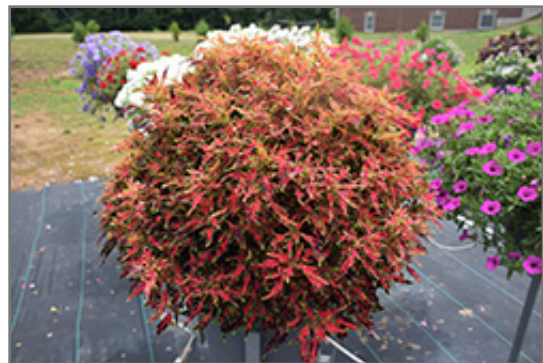
ColorBlaze Mini Me Watermelon Coleus