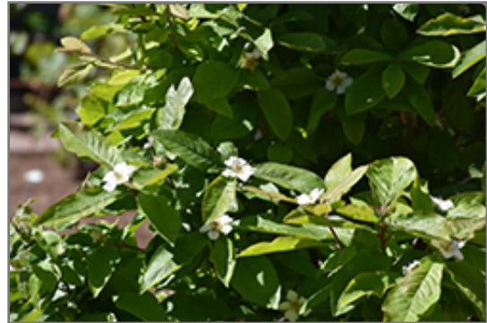
Marron Medlar flowers

Marron Medlar is clothed in stunning white cup-shaped flowers at the ends of the branches in mid spring. It has green deciduous foliage. The fuzzy pointy leaves turn red in fall. The fruits are showy coppery-bronze hips which fade to dark brown over time, which are carried in abundance from mid summer to mid fall.