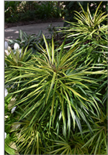
Variegated Miagos Bush

This tropical plant performs well in both full sun and full shade. It prefers to grow in average to moist conditions, and shouldn't be allowed to dry out. This plant does not require much in the way of fertilizing once established. It is not particular as to soil pH, but grows best in sandy soils. It is somewhat tolerant of urban pollution. This is a selected variety of a species not originally from North America.; however, as a cultivated variety, be aware that it may be subject to certain restrictions or prohibitions on propagation.