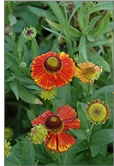
Sahin's Early Flowerer Sneezeweed flowers

Sahin's Early Flowerer Sneezeweed is an herbaceous perennial with an upright spreading habit of growth. Its medium texture blends into the garden, but can always be balanced by a couple of finer or coarser plants for an effective composition.