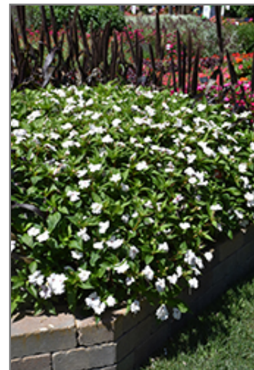
Solarscape White Shimmer Impatiens in bloom