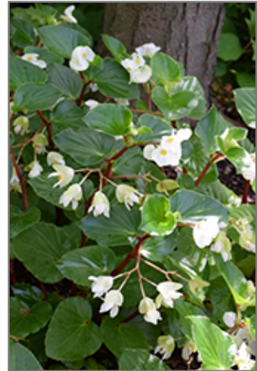
Megawatt White Green Leaf Begonia flowers

This is a high maintenance plant that will require regular care and upkeep, and usually looks its best without pruning, although it will tolerate pruning. Deer don't particularly care for this plant and will usually leave it alone in favor of tastier treats. Gardeners should be aware of the following characteristic(s) that may warrant special consideration;