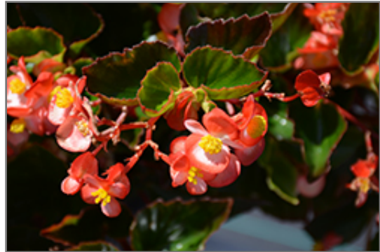
Hula Bicolor Red White Begonia flowers

Hula Bicolor Red White Begonia is a fine choice for the garden, but it is also a good selection for planting in outdoor containers and hanging baskets. Because of its spreading habit of growth, it is ideally suited for use as a 'spiller' in the 'spiller-thriller-filler' container combination; plant it near the edges where it can spill gracefully over the pot. Note that when growing plants in outdoor containers and baskets, they may require more frequent waterings than they would in the yard or garden.