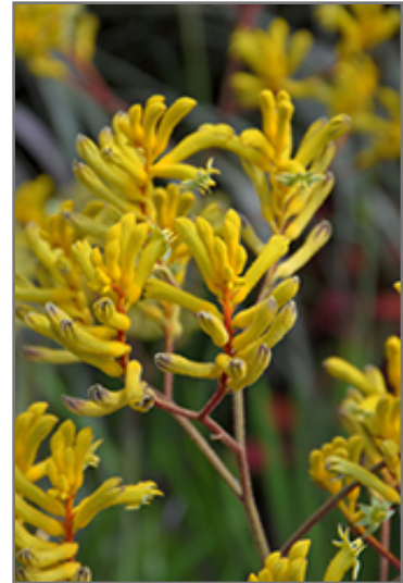
Big Roo Yellow Kangaroo Paw flowers