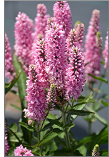
Skyward Pink Long-leaf Speedwell flowers

Skyward Pink Long-leaf Speedwell is a fine choice for the garden, but it is also a good selection for planting in outdoor pots and containers. It is often used as a 'filler' in the 'spiller-thriller-filler' container combination, providing a mass of flowers against which the larger thriller plants stand out. Note that when growing plants in outdoor containers and baskets, they may require more frequent waterings than they would in the yard or garden.