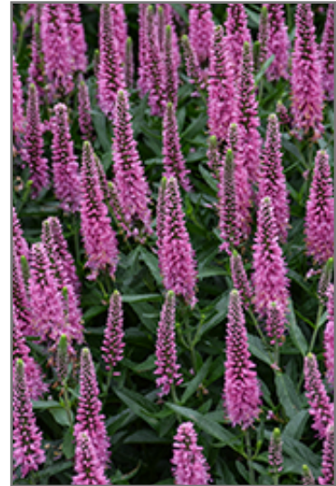
Skyward Pink Long-leaf Speedwell flowers

Skyward Pink Long-leaf Speedwell is recommended for the following landscape applications;