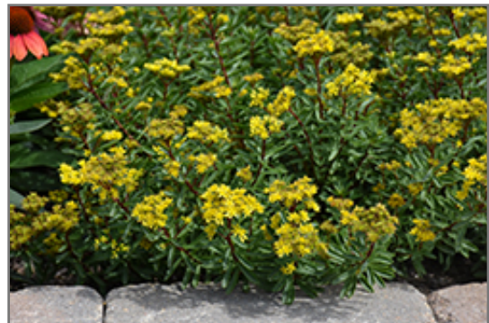
Yellow Diamonds Stonecrop flowers