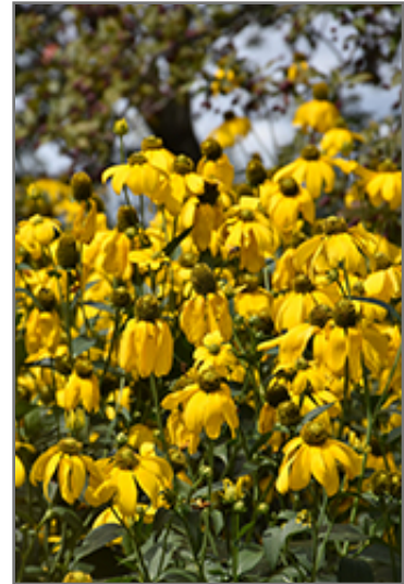
Cutleaf Coneflower flowers

Cutleaf Coneflower is recommended for the following landscape applications;