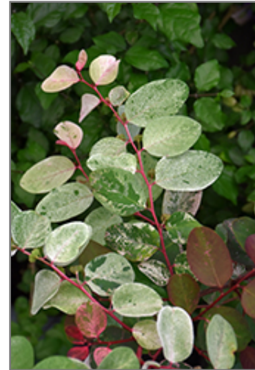
Dwarf Red-leaved Snow Bush foliage