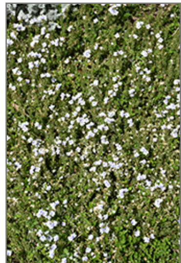
Snowmass Blue-Eyed Veronica in bloom