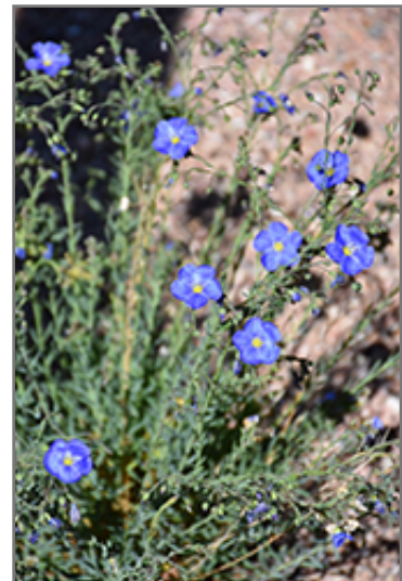
Wild Blue Flax flowers