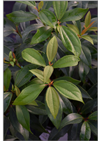
Yang Viburnum foliage

Yang Viburnum is recommended for the following landscape applications;