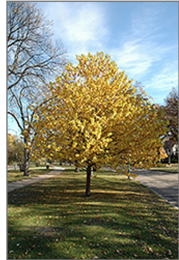
Amur Cherry in fall

This tree should only be grown in full sunlight. It does best in average to evenly moist conditions, but will not tolerate standing water. It is not particular as to soil type or pH. It is somewhat tolerant of urban pollution. This species is not originally from North America.