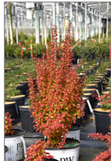
Sunjoy Orange Pillar Japanese Barberry