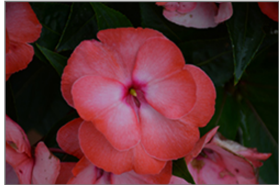
Painted Select Peach New Guinea Impatiens flowers

Painted Select Peach New Guinea Impatiens is recommended for the following landscape applications;