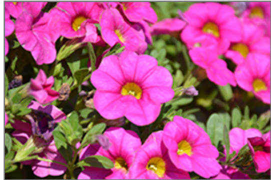
Unique Pink Calibrachoa flowers

Unique Pink Calibrachoa is recommended for the following landscape applications;