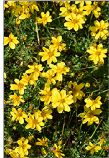
Bidy Gonzales Big Bidens flowers

Bidy Gonzales Big Bidens is recommended for the following landscape applications;