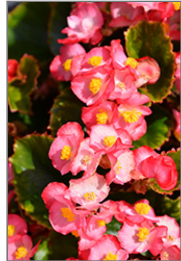
Ambassador Rose Blush Begonia flowers