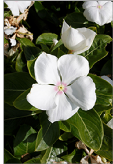
Vitesse White Vinca flowers

Vitesse White Vinca is recommended for the following landscape applications;