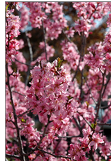
Muckle Plum (tree form) flowers