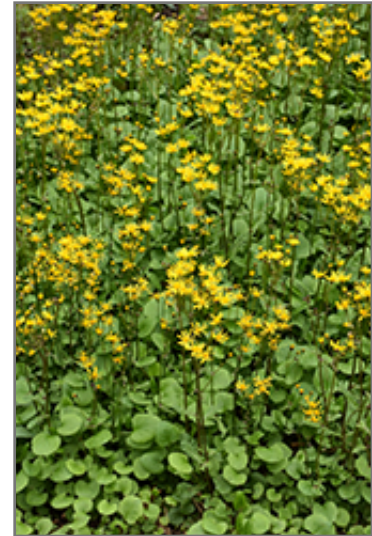
Golden Ragwort in bloom

Golden Ragwort is an herbaceous perennial with an upright spreading habit of growth. Its relatively coarse texture can be used to stand it apart from other garden plants with finer foliage.