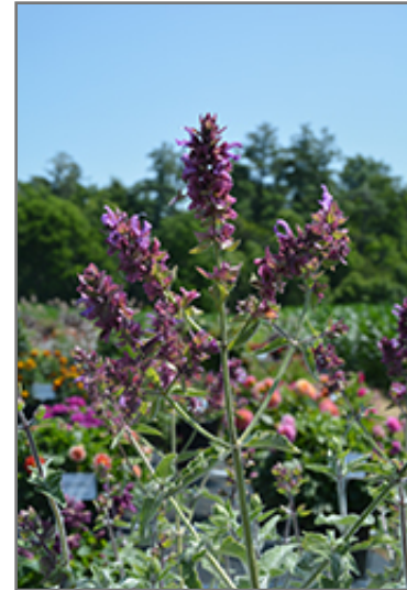
Lancelot Canary Island Sage flowers

Lancelot Canary Island Sage is an herbaceous perennial with an upright spreading habit of growth. Its relatively fine texture sets it apart from other garden plants with less refined foliage.