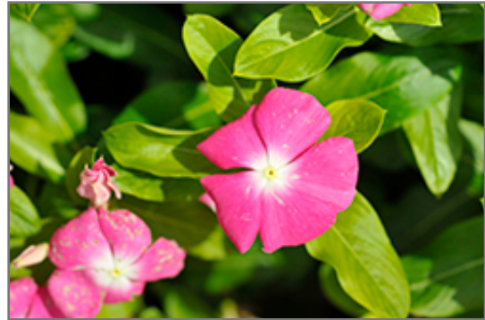
Pacifica XP Rose Halo Vinca flowers

This plant will require occasional maintenance and upkeep, and should not require much pruning, except when necessary, such as to remove dieback. It is a good choice for attracting butterflies to your yard, but is not particularly attractive to deer who tend to leave it alone in favor of tastier treats. It has no significant negative characteristics.