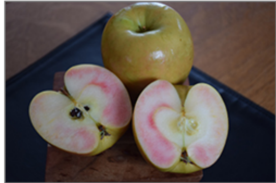
Pink Pearl Apple fruit and flesh

Pink Pearl Apple features showy clusters of lightly-scented white flowers with shell pink overtones along the branches from early to mid spring, which emerge from distinctive red flower buds. It has forest green deciduous foliage. The pointy leaves turn yellow in fall. The fruits are showy chartreuse apples with a rose blush, which are carried in abundance from mid to late summer. The fruit can be messy if allowed to drop on the lawn or walkways, and may require occasional clean-up.