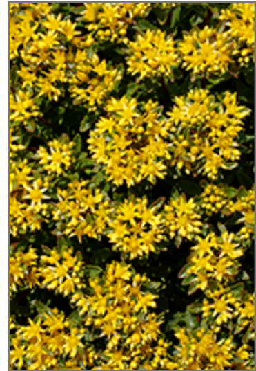
Rock 'N Round Bright Idea Stonecrop flowers

This is a relatively low maintenance plant, and is best cleaned up in early spring before it resumes active growth for the season. It is a good choice for attracting bees and butterflies to your yard, but is not particularly attractive to deer who tend to leave it alone in favor of tastier treats. It has no significant negative characteristics.