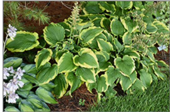
Spartacus Hosta

Spartacus Hosta is recommended for the following landscape applications;