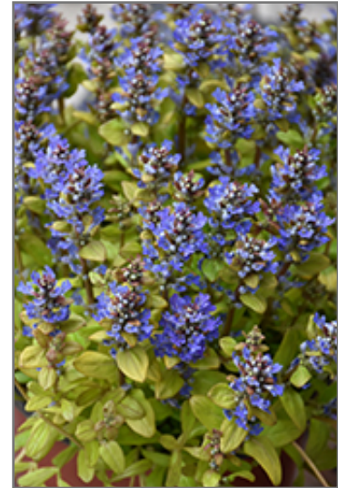
Feathered Friends Fancy Finch Bugleweed flowers

This plant will require occasional maintenance and upkeep, and should not require much pruning, except when necessary, such as to remove dieback. It is a good choice for attracting butterflies to your yard, but is not particularly attractive to deer who tend to leave it alone in favor of tastier treats. Gardeners should be aware of the following characteristic(s) that may warrant special consideration;