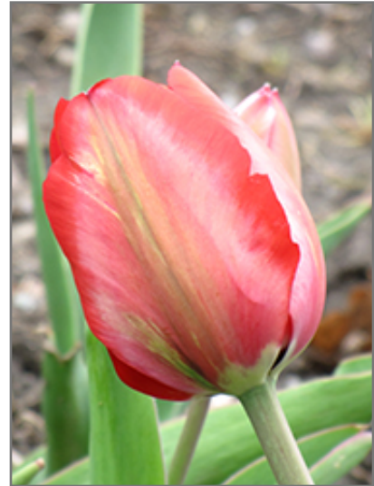
Menton Tulip flowers