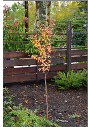
Milk And Honey Japanese Stewartia in fall