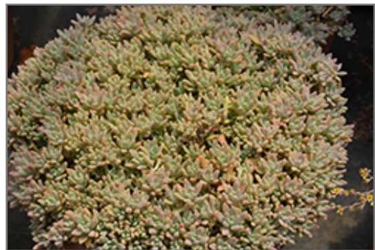
Darley Sunshine Graptosedum