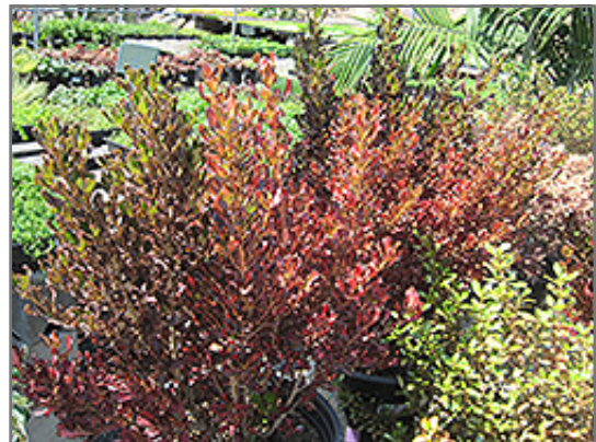
Pacific Sunset Mirror Bush