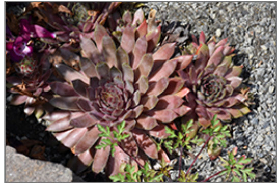
Kalinda Hens And Chicks