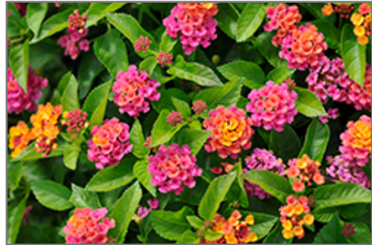
Bloomify Rose Lantana flowers

Bloomify Rose Lantana is recommended for the following landscape applications;