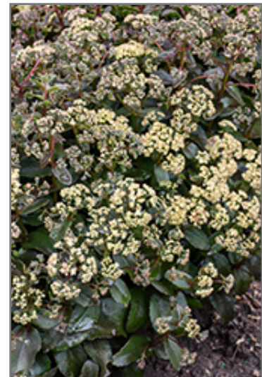
Peach Pearls Stonecrop in bloom