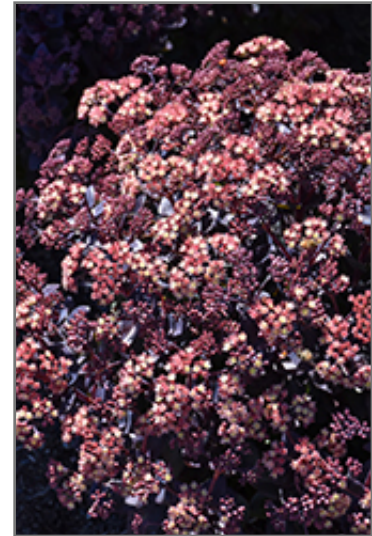
Peach Pearls Stonecrop flowers

Peach Pearls Stonecrop is recommended for the following landscape applications;