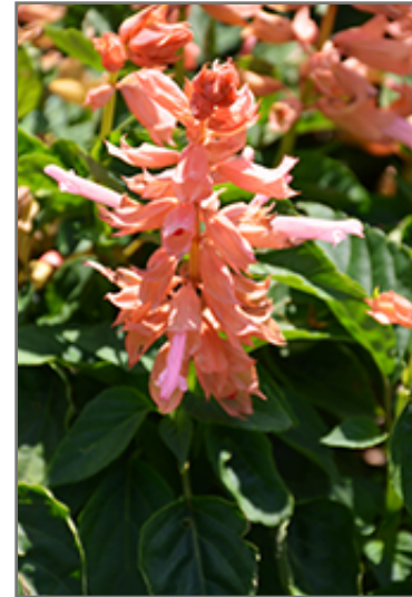
Grandstand Salmon Salvia flowers

Grandstand Salmon Salvia is recommended for the following landscape applications;