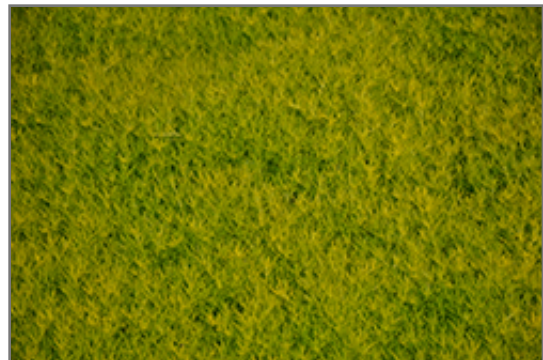
Scotch Moss foliage