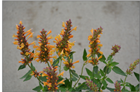
Kudos Gold Hyssop flowers