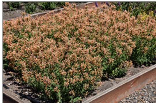
Kudos Gold Hyssop in bloom