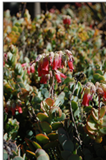
Marnier's Kalanchoe flowers

Marnier's Kalanchoe is a fine choice for the garden, but it is also a good selection for planting in outdoor pots and containers. It can be used either as 'filler' or as a 'thriller' in the 'spiller-thriller-filler' container combination, depending on the height and form of the other plants used in the container planting. Note that when growing plants in outdoor containers and baskets, they may require more frequent waterings than they would in the yard or garden.