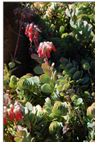
Marnier's Kalanchoe in bloom