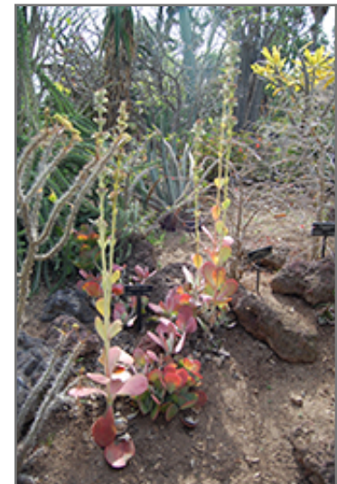
Paddle Plant in bloom