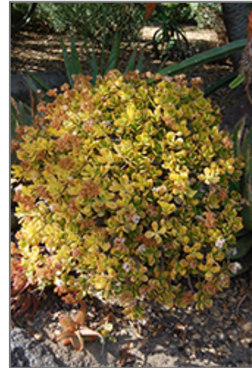
Hummel's Sunset Golden Jade Plant in bloom

Hummel's Sunset Golden Jade Plant is a multi-stemmed evergreen shrub with an upright spreading habit of growth. Its average texture blends into the landscape, but can be balanced by one or two finer or coarser trees or shrubs for an effective composition.