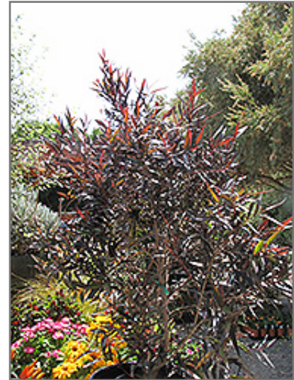
Aftershock Agonis

Aftershock Agonis is recommended for the following landscape applications;