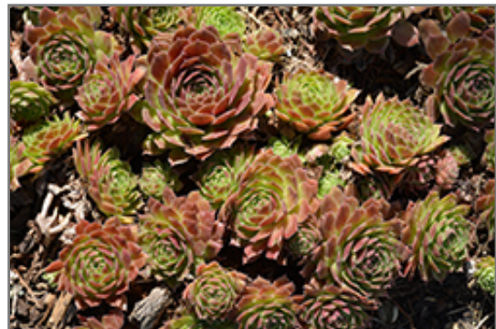
Rocknoll Rosette Hens And Chicks